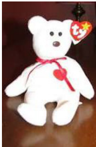
Beanie Baby on ETSY selling for $24,000