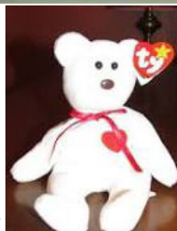
Beanie Baby on ETSY selling for $24,000